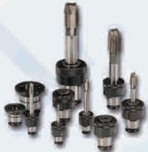
Tap collets & adapters