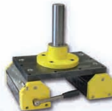
Magnetic clamp B2