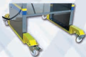
Pneumatics and electronics