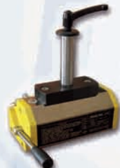
Magnetic clamp B1