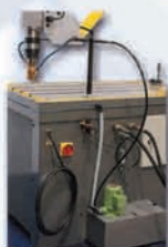
Cooler pump & tank