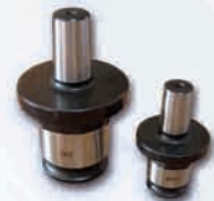
Drill chuck adapters