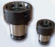
Threading die collets