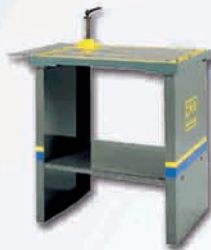
Pneumatics and electronics